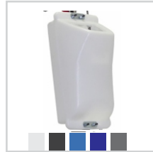
4 Gallon Solution Tank 7 Stock Colors #A0001-Color4