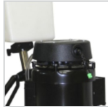
Osprey Sprayer Kit Motor Mounted Solution Sprayer Pump, 2.5 Gallon Solution Tank #TH1010-BRUTE