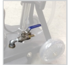
Frame Valve for Solution Tank for Brute, Merlin, TEXHD, Pro, Osprey #KIT2061