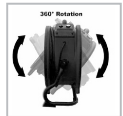
Direct Air at Every Angle