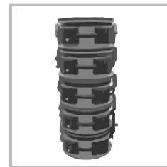
Stackable Chassis for Storage Only