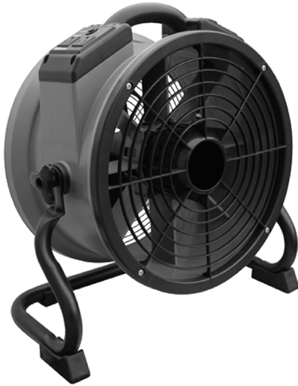
HAWK BH25AD Axial 1720 CFM Air Mover

The HAWK BH25AD Axial Air Mover produces up to 1720 CFM airflow with a variable control dial switch. The low amp draw and dual built-in 12 amp power outlets allows for multiple units to be used in daisy chain.