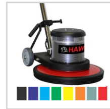
Private Brand Machines 7 Stock Colors