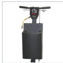
6 Gal. Solution Tank #SME-2QRBLK