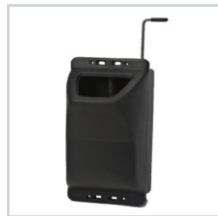
2.5 Gallon Solution Tank #A0001-RAPBLK2.5