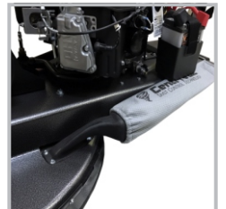
Optional Active Dust Control Kit