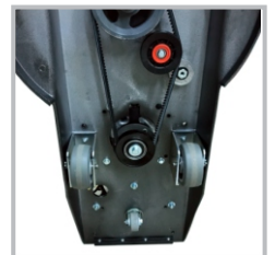
V-Belt Drives Pads at 2000 RPM