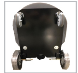
Wheels, Casters & Molded Tank are Mounted on Strong Steel Frame