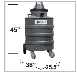
Titan 55 Tank Vacuum