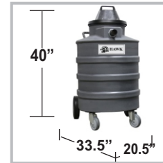
Titan 29 Tank Vacuum