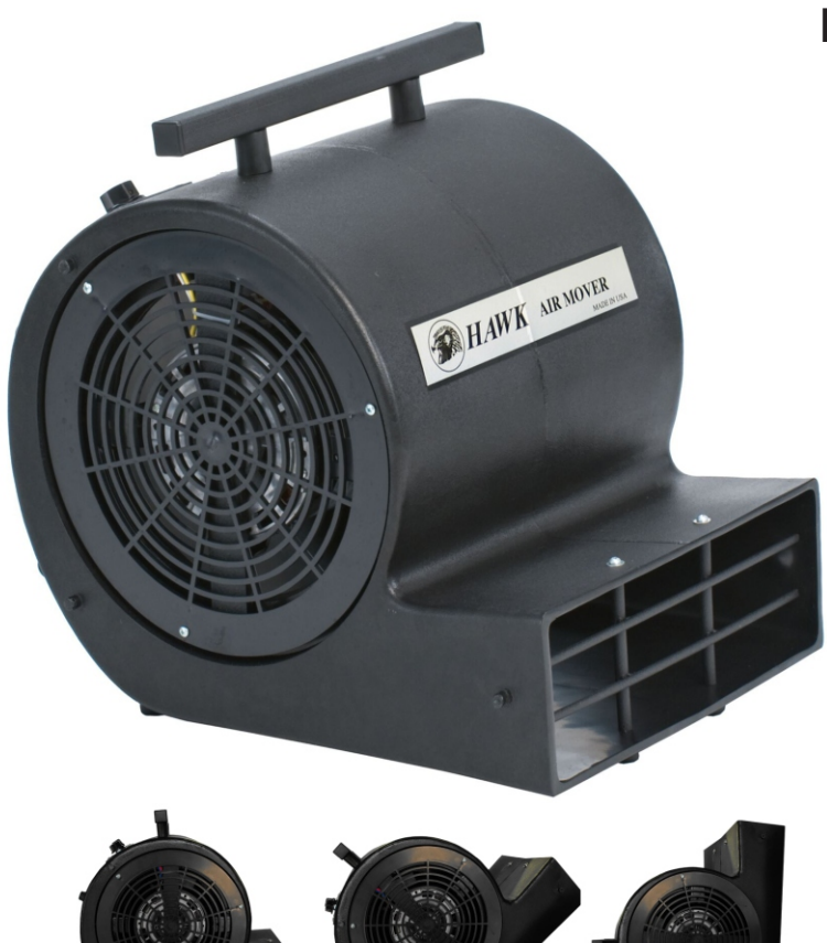
Moves Air at 3 Angles