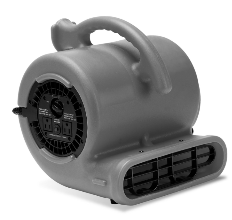
HAWK BVP25D 900 CFM Air Mover