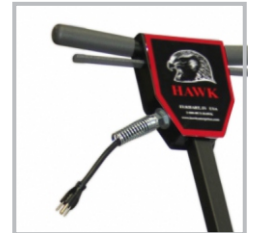
2-Piece 50 ft. Power Cord with Molded Plug