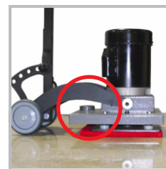
Floating Head Frame with 1.5" Vacuum Port