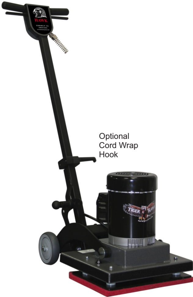
Optional Cord Wrap Hook