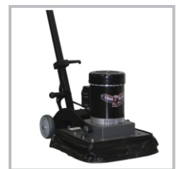
Optional Full Wraparound Dust Skirt #TH1011-1410