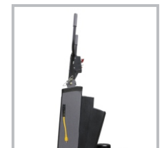
Handle Folds Up and Pin-Locks for Transport & Storage