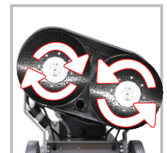
Two Counter-Rotating Tools / Pad Drivers Run a 30" Scrub Path