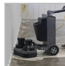
Engineered to Work Within 1/2" of Walls