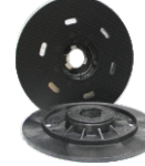
(2) 12" Pad Driver Dual Set w/ Pad Centering Clamp A0034-Dual