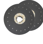
(2) 12" Diamond Dual Pad Set CLAW15-Dual