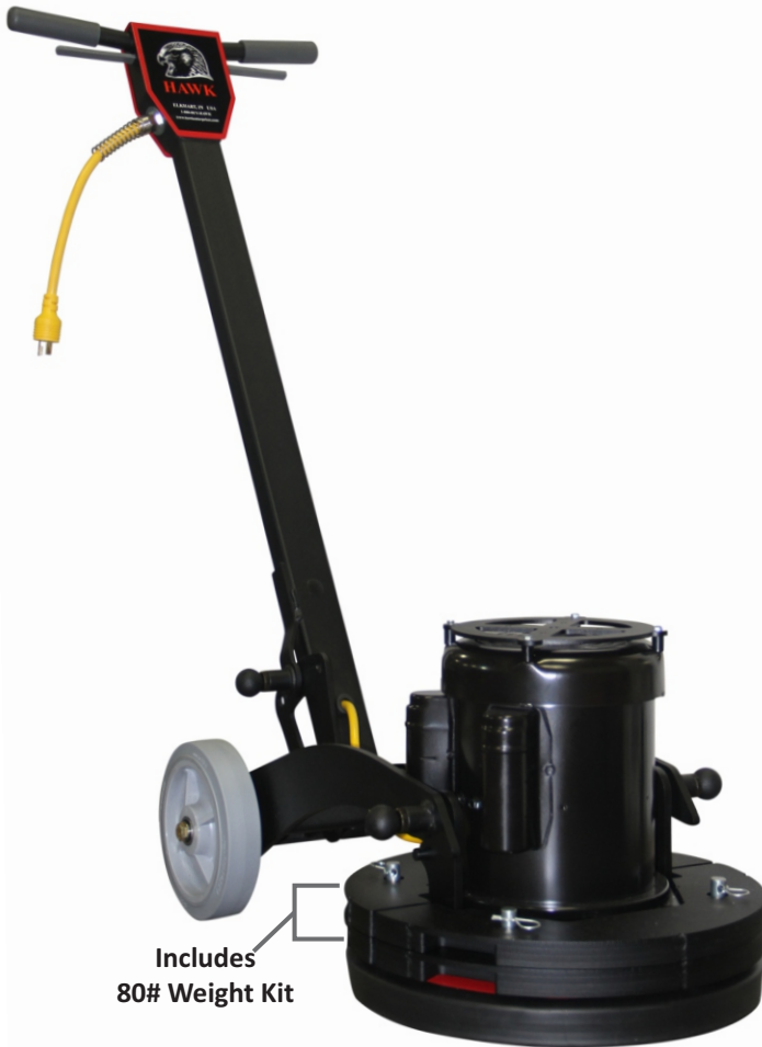
Includes 80# Weight Kit