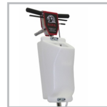
Optional 4 Gallon Solution Tank