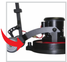
Optional Dust Control Ring Connects to Tank