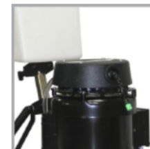
Optional Osprey Sprayer Kit