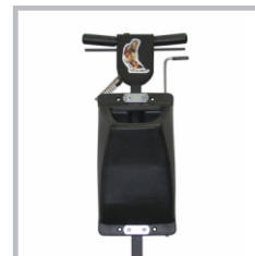
Optional 2.5-Gallon Solution Tank