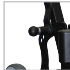
Handle with 4-Position Pin Lock