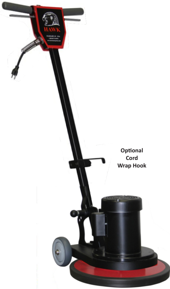
Optional Cord Wrap Hook

Machine operators will appreciate the performance, versatility and value of the HAWK Mighty. The 1.0 HP TEFC (Totally Enclosed Fan Cooled) AC motor and XHD gears deliver huge power in a small and manageable machine. Use the 17" or 20" Mighty for the big jobs.