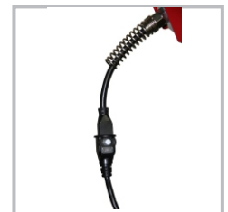
Two Piece (14-3) Pig-Tail Cord w/ Molded Plug