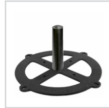
Weight Post Mount for Hexagonal Weights #HP0008- 45INCHBRUTE Use on 180 Frame TEFC Motors