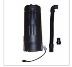
Vacuum Assembly Kit #FM1011