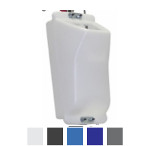
4 Gallon Solution Tank 7 Stock Colors #A0001-Color4