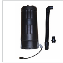
Vacuum Assembly Kit #Th1011