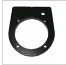
20# Frame Weight* #HPA0032-2P Recommend for 11:1 XHD Gear Models Only