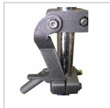
Power Lock Kit Locks the Handle in the "Up" position for Brute, TEXHD #HP0005-BLACK