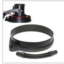
Dust Pickup Systems for All Floating Head Rotary Design Models #HP0031-DC17- GLIDE