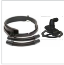
Dust Pickup System for 180 Frame TE Motors Rotary Machine Models #HP0031-DC17- BRUTEKIT #HP0031-DC20- BRUTEKIT