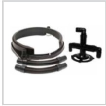
Dust Pickup Systems for 66 Frame Motors #HP0031-DC17- STANDKIT