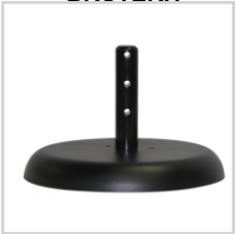
4.5" Weight Post Mount for Hexagonal Weights# #HP-0008-45STAND (Use on 66 Frame Motors)