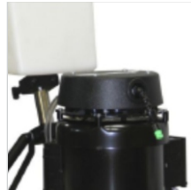
Osprey Sprayer Kit Motor Mounted Solution Sprayer Pump, 2.5 Gallon Solution Tank #TH1010-BRUTE