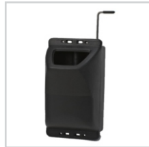
2.5 Gallon Solution Tank #A0001-RAPBLK2.5