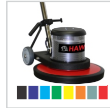
Private Brand Machines 7 Stock Colors