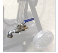
Frame Valve for Solution Tank for Brute, Merlin, TEXHD, Pro, Osprey #KIT2061