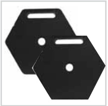
Hexagonal Weight for Rotary Motor Mount #HPA0028-10P - 10 lbs. #HPA0028-25P - 25 lbs.