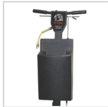
6 Gal. Solution Tank #SME-2QRBLK