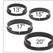
Splash Guard #SPLASH13 - 13" #SPLASH15 - 15" #SPLASH17 - 17" #SPLASH20 - 20"