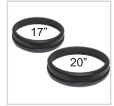
Splash Guard SPLASH17-WD -17" SPLASH20-WD - 20" For Glide, Merlin Machines