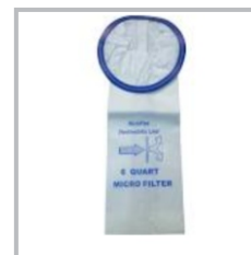
Disposable Paper Vacuum Bags #HPVA005-3