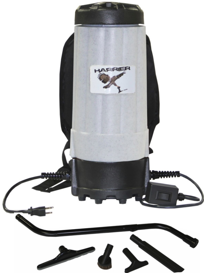
Includes Tool Kit #HPV-Back-1.5L KIT