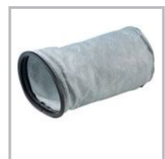
Washable Cloth Bags #HPV-BACK-CLTH BAG