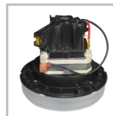
Powerful 1-Stage Motor