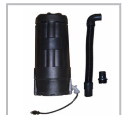
Optional Dust Control Kit #TH1011-RT