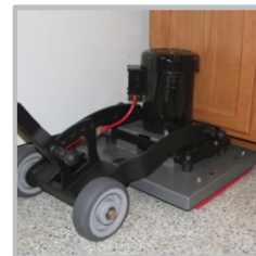
Orbiting Pads and WD™ Handle - Works in Tight Spaces