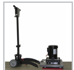
Disassembles Without Tools for Easy Transport & Storage