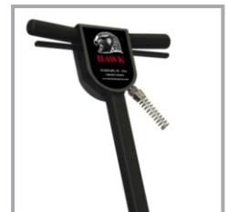
Welded Powder- Coated Steel Construction