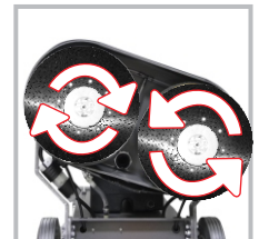
Two Counter-Rotating Tools / Pad Drivers Run a 30" Scrub Path