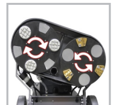
Counter-Rotating Tools / Pad Drivers