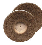
(2)12" Polish Dual Brush Set A0035-Dual