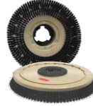
(2)12" Stiff Poly Dual Brush Set A0036-Dual