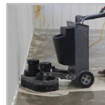
Engineered to polish within 1/2" of walls