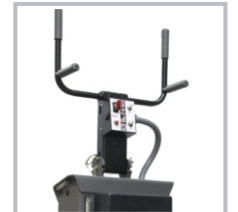
Handle with Controls Folds Up for Transport