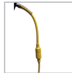
Two Piece Twist Lock Connects Machine to 50 ft. Power Cord