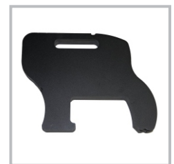
Optional Carriage Weight Kit (28. lbs.)