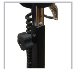
Telescoping Handle Adjusts from 36" to 48"