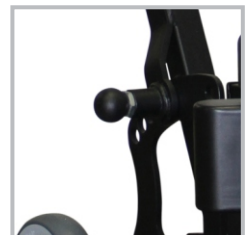
Handle with 6-Position Pin Lock