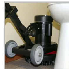
Works in Tight Spaces