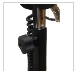
Telescoping Handle Adjusts from 36" to 48"