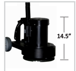
Low Rise Profile - Easy Working Under Sinks and Partitions