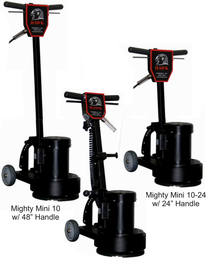
Mighty Mini 10 w/ 48" Handle