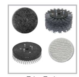
Talon Tools Strip, Scrub & Polish