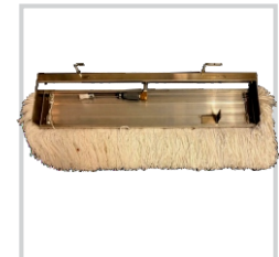
28", 36" & 48" Lambs Wool / Yarn Pads Fit on Applicator Bar