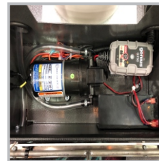
Battery Powered Pump Moves Finishes from Pail to Floor