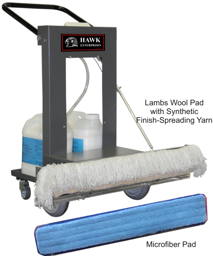
Lambs Wool Pad with Synthetic Finish-Spreading Yarn