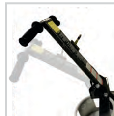
Adjustable Height Ergonomic Handle for Operator Comfort