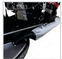
Optional Active Dust Control Kit