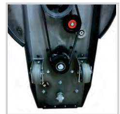
V-Belt Drives Pads at 2000 RPM