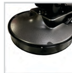
Optional Splash Ring