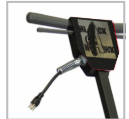
2-Piece 50 ft. Power Cord with Molded Plug