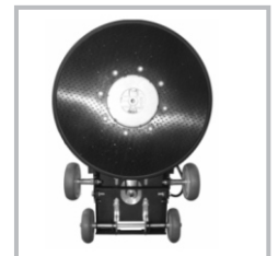
Includes Harpoon Style Pad Driver