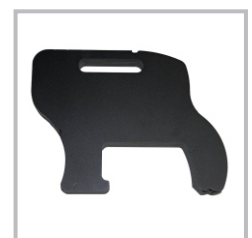
Optional Carriage Weight Kit (28. lbs.)