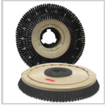
Poly Scrub Brush For general scrubbing #A0049 - 10" with Riser & "B" Plate