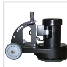
Handle with 6-Position Pin Lock