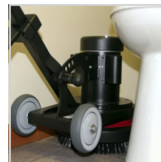
Works in Tight Spaces