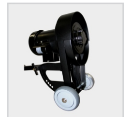
Tip Back to Mount a 9" Pad Driver or 10" Brush with Riser & "B" Plate