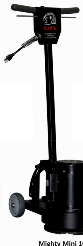
Mighty Mini 10-48 w/ Optional 48" Handle