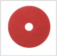
Red Buffing Pad (5 Pack) Use at 175-600 RPM for everyday cleaning and light scrubbing. #A0026-10R-CS - 9"