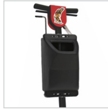
2.5 Gallon Solution Tank #A001-BLK25 - Black