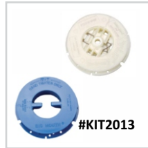
Pad Centering Clamp Pad mount - 2 piece design #KIT2013 - Screw Lock #KIT2014 - Spring Lock