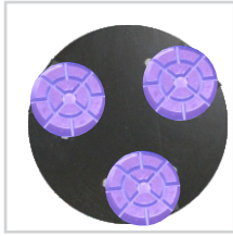
Claw 10 9" Claw Plate holds (3) 3" Diamond Tools #CLAW10 - 10"