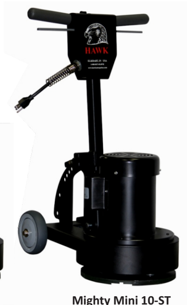
Mighty Mini 10-ST w/ Standard 24" Handle