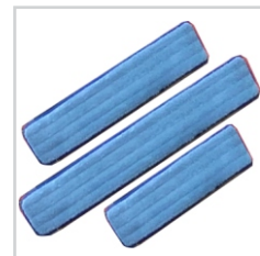
28", 36" & 48" Microfiber Pads Apply Water-Based Finishes