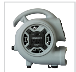
(2) 12 Amp Power Outlets on BH20DT