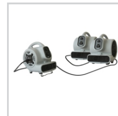
BH20DT Moves More Air with Daisy Chained Power