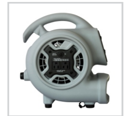
(2) 12 Amp Power Outlets on BH20DT