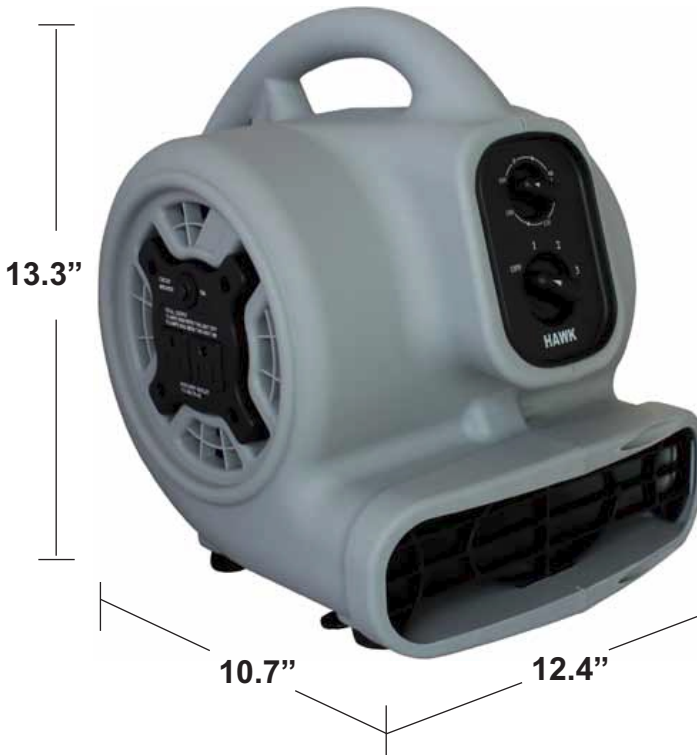
HAWK BH20DT 800 CFM Air Mover