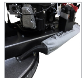
Optional Active Dust Control Kit