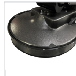
Optional Splash Ring