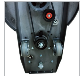
V-Belt Drives Pads at 2000 RPM