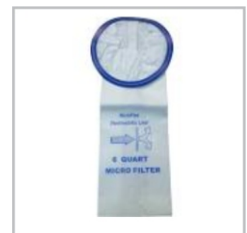
Disposable Paper Vacuum Bags #HPVA005-3