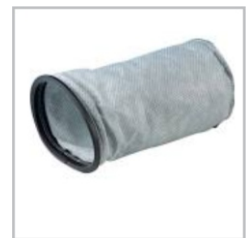
Washable Cloth Bags #HPV-BACK-CLTH BAG