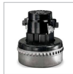
Powerful 1-Stage Motor