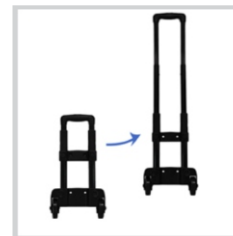
Optional Telescopic Transport Cart for BH50 BH50-WHLKT