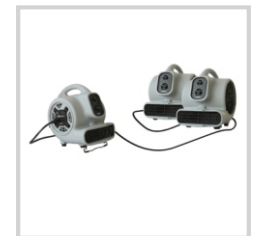
BH20DT Moves More Air with Daisy Chained Power