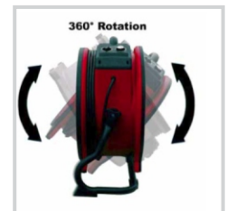
Direct Air at Every Angle