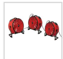
Move More Air with Daisy Chained Power