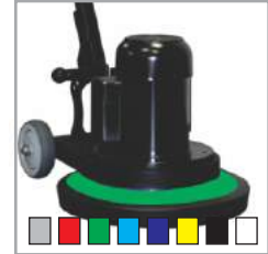
8 Stock Colors