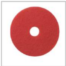
Red Buffing Pad (5 Pack) Use at 175-600 RPM for everyday cleaning and light scrubbing. #A0026-13R-CS - 13" #A0026-15R-CS - 15"