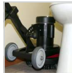
Works in Tight Spaces