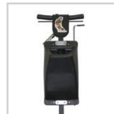
Optional 2.5-Gallon Solution Tank