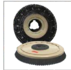
80 Grit Brush For aggressive for general scrubbing or stripping finishes from hard surfaces. Cleans wide grout lines. #A0018 - 13" #A0038 - 15"