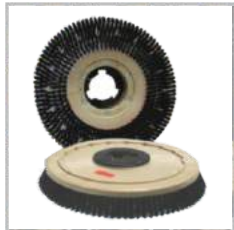
Poly Scrub Brush Use this poly bristle brush with a detergent for lighter-duty scrubbing on waxed or finished floors. #A0020 - 13" #A0036 - 15"