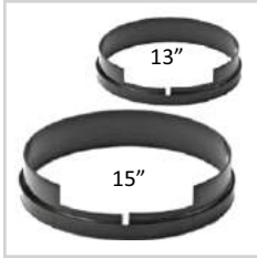
Splash Guard SPLASH13 - 13" SPLASH15 - 15"