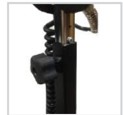
Telescoping Handle Adjusts from 36" to 48"