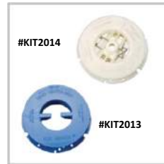
Pad Centering Clamp - 2-Piece 2-piece clamp clips together securely holding any size pad. #KIT2013 - Screw Lock #KIT2014 - Spring Lock