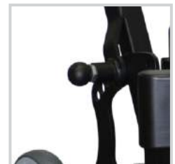
Handle with 6-Position Pin Lock