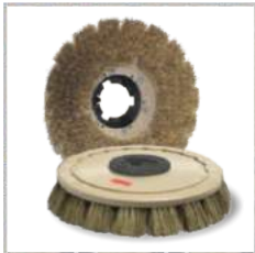
Tampico Polishing Brush 100% White Tampico is naturally acid resistant. Great for general scrubbing and polishing marble and other hard surface floors. #A0021 - 13" #A0035 - 15"