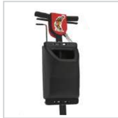
2.5 Gallon Solution Tank A001-BLK25 - Black