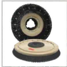
35 Grit Brush For general scrubbing and frequent cleaning. Flexible enough to scrub narrow grout lines. #A0018-1 - 13" #A0008-1 - 15"