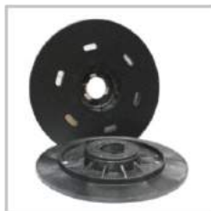
Premium Double Hook Pad Driver Molded polymer pad face has hundreds of individual hooks that securely grip and hold pads. Riser and showerfeed block #A0017 - 13" #A0034 - 15"