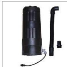
Vacuum Assembly Kit #TH1011