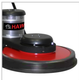
Optional Splash Guard SPLASH13 - 13" SPLASH15 - 15" SPLASH17 - 17" SPLASH20 - 20"