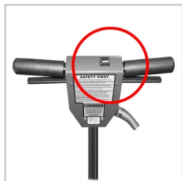
Thumb Operated Safety Switch