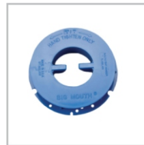
Pad Centering Clamp - Screw Mount KIT2013