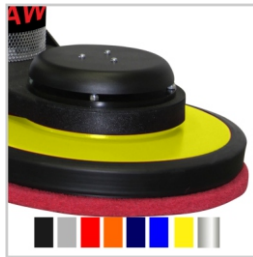
7 Private Brand Colors Plus Chrome