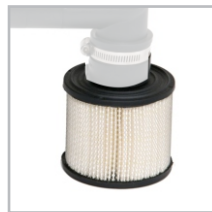
Dust Filter A00029-2