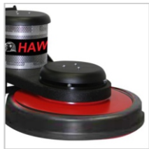
Optional Splash Guard SPLASH13 - 13" SPLASH15 - 15" SPLASH17 - 17" SPLASH20 - 20"