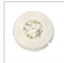
Pad Centering Clamp - Spring Mount KIT2014