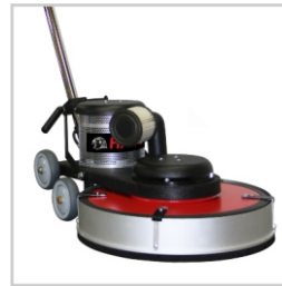
Dust Control (DC) Models Use Includes Dust Ring and Dust Filter (#A0029-2)