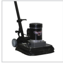
Full Wraparound Dust Skirt HP0031-DC-TIGER2014