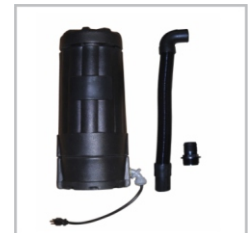
Add the Optional Dust Control Kit