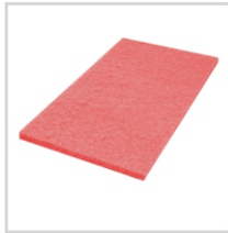
20"x14" Red Orbital Scrubbing Pads - 5 Case