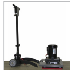
Disassembles for Easy Transport & Storage