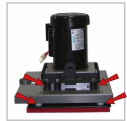
Unique Vibration Damping Design