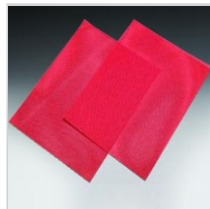
20"x14" Abrasive Screen A0074-2014-80 - 80 Grit A0074-2014-120 - 120 Grit A0074-2014-180 - 180 Grit