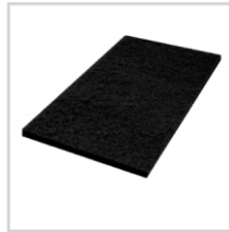
20"x14" Black Orbital Stripping Pads - 5 Case A0069-2014-CS