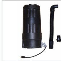
Vacuum Assembly Kit TH1001