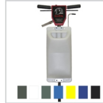
4 Gallon Solution Tank 5 Stock Colors 3 Special Order Colors A0001-4GLIDE