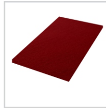
20"x14" Maroon Chemical Free Pads 5 Case A0064-2014-CS