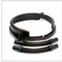
Dust Pickup Systems for 66 Frame Motors #HP0031-DC17-STANDKIT #HP0031-DC20-STANDKIT