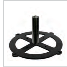
Weight Post Mount for Hexagonal Weights #HP0008-45INCHBRUTE Use on 180 Frame TEFC Motors