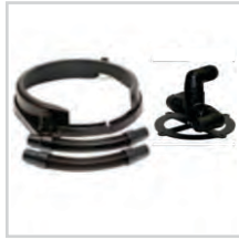
Dust Pickup System for 180 Frame TE Motors Rotary Machine Models #HP0031-DC17-BRUTEKIT #HP0031-DC20-BRUTEKIT