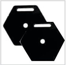
Hexagonal Weight for Rotary Motor Mount #HPA0028-10P - 10 lbs. #HPA0028-25P - 25 lbs.