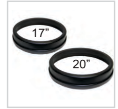
Splash Guard SPLASH17-WD -17" SPLASH20-WD - 20" For Glide, Merlin Machines