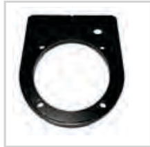
20# Frame Weight* #HPA0032-2P Recommend for 11:1 XHD Gear Models Only