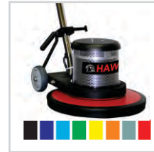
Private Brand Machines 7 Stock Colors Plus Chrome