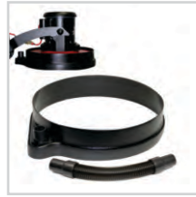
Dust Pickup Systems for All Floating Head Rotary Design Models #HP0031-DC17-GLIDE #HP0031-DC20-GLIDE