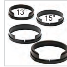
Splash Guard #SPLASH13 - 13" #SPLASH15 - 15" #SPLASH17 -17" #SPLASH20 - 20"