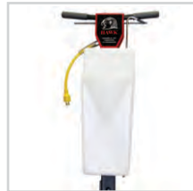
4.5 Gallon Solution Tank for Glide, Merlin #SME-0193-INATASSY