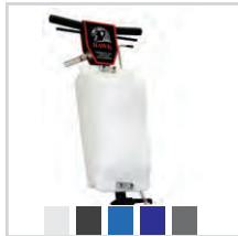
4 Gallon Solution Tank 5 Stock Colors 4 Special Order Colors #A0001-4-Color