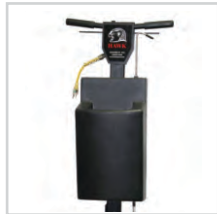
6 Gal. Solution Tank #SME0193-2BLK6-QR for WingSpan