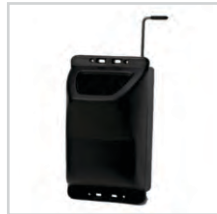
2.5 Gallon Solution Tank for Mighty #A001-BLK25 - Black