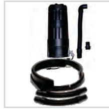
Vacuum Assembly Kit Dust Ring, Tank Vacuum & Hardware #TH1011-STD17 - 17" #TH1011-STD20 - 20"