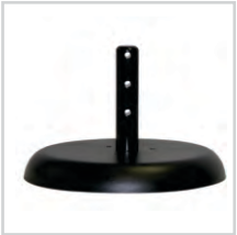
4.5" Weight Post Mount for Hexagonal Weights# #HP-0008-45STAND (Use on 66 Frame Motors)