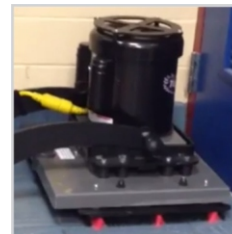
Works Along Baseboards and Into Corners