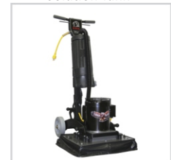
TH2014-V Model Adds the 6 Quart Tank Vac, Dust Skirt and Hoses