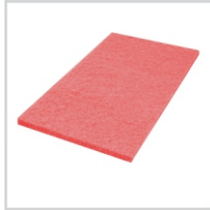
20"x14" Red Orbital Scrubbing Pads - 5 Case A0066-2014-CS