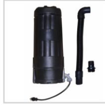
Vacuum Assembly Kit TH1011