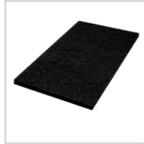
20"x14" Black Orbital Stripping Pads - 5 Case A0069-2014-CS