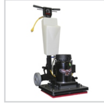
2014 with 4.5 Gallon Solution Tank & Spray Pump TH2014-SP TH1010 (Kit)