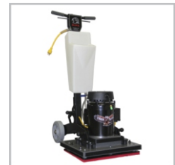
TH2014-SP Model Adds the Spray Pump and Solution Tank