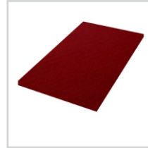
20"x14" Maroon Chemical Free Pads 5 Case A0064-2014-CS