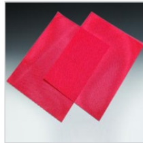
20x14" Abrasive Screen A0074-2014-80 - 80 Grit A0074-2014-120 - 120 Grit A0074-2014-180 - 180 Grit