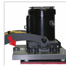
Steel Frame with Rear Vacuum Port