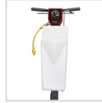
4.5 Gallon Solution Tank SME0193-THASSY