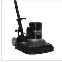
Full Wraparound Dust Skirt HP0031-DC-TIGER2014