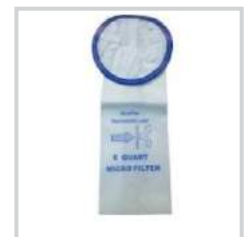
Disposable Paper Vacuum Bags #HPVA005-3