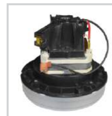
Powerful 1-Stage Motor