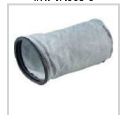
Washable Cloth Bags #HPV-BACK-CLTH BAG