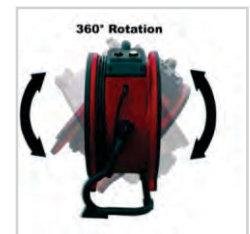
Direct Air at Every Angle