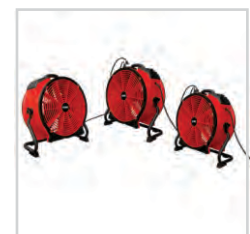
Move More Air with Daisy Chained Power