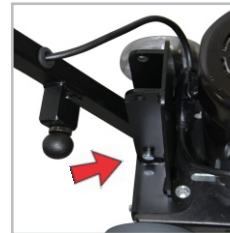
Pull the Pin for Easy Handle Removal