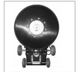
Harpoon Style Pad Driver with Pad Centering Clamp