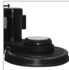
Optional Splash Guard SPLASH20 - 20"