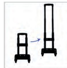
Optional Telescopic Transport Cart for BH50 BH50-WHLKT