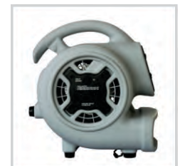
12 Amp Power Outlet on BH20