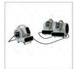
BH20DT Moves More Air with Daisy Chained Power