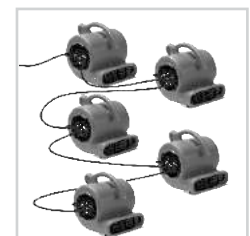
Daisy Chain up to 5 Units for Extra Air Moving Power