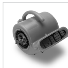
Air Flow in 3 Angles 0, 45 & 90 Degrees