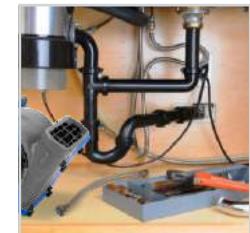
Works in Tight Spaces for Tough Drying Jobs