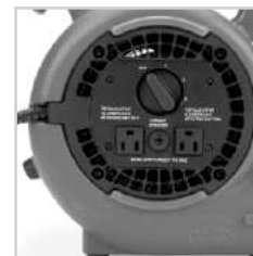
Side Mount 3-Speed Switch and Dual 110V Power Outlets