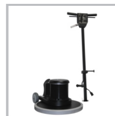
Remove/Install the Handle in 60 Seconds