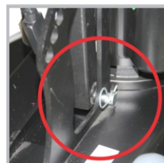
Remove the Handle Mounting Pin w/o Tools