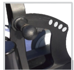
Exclusive Pin-Set™ Handle Lock - 4 Height