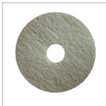
Hogs Hair Burnishing Pads (5 Pack) #A0025-13P-CS - 13" #A0025-15P-CS - 15" #A0025-16P-CS - 16" #A0025-17P-CS - 17" #A0025-19P-CS - 19" #A0025-20P-CS - 20"