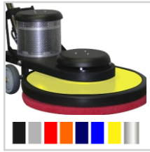
Private Brand Machines 7 Stock Colors Plus Chrome