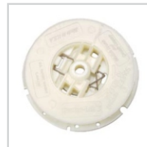
Pad Centering Clamp Spring Mount #KIT2014