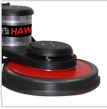
Splash Guard #SPLASH13 - 13" #SPLASH15 - 15" #SPLASH17 - 17" #SPLASH20 - 20"