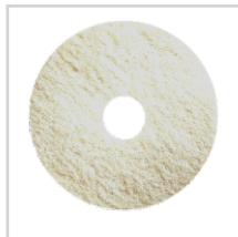
White Polishing Pads (5 Pack) #A0025-13P-W - 13" #A0025-15P-W - 15" #A0025-16P-W - 16" #A0025-17P-W - 17" #A0025-19P-W - 19" #A0025-20P-W - 20"