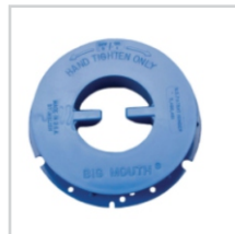
Pad Centering Clamp Screw Mount #KIT2013