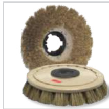
Tampico Polishing / Scrubbing Brush #A0021 - 13" #A0035 - 15" #A0004 - 17" #A0005 - 20"