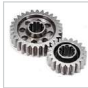
Industrial 11:1 Gears on XHD