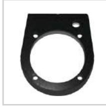
20# Frame Weight #HPA0032-2P