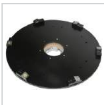
HAWK Surface Prep Scraper with Replaceable Cutting Blades for XHD #HP0033 - 17" #HP0034 - 20"