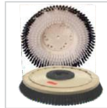
Nylon Carpet Brush Scrub with Soft & Stiff Nylon Bristle Mix #A0016 - 13" #A0037 - 15" #A0006 - 17" #A0007 - 20"