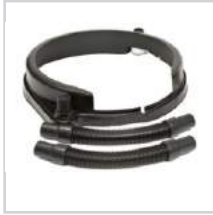
Dust Pickup Systems for 66 Frame Motors #HP0031-DC17-STANDKIT #HP0031-DC20-STANDKIT