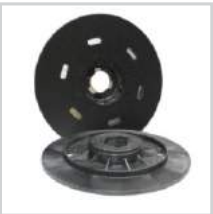
Premium Double Hook Pad Driver w/ Riser #A0017 - 13" #A0034 - 15" #A0010 - 17" #A0011 - 20"