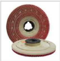
Tufted Pad Driver 3/4" Long Stiff Poly Bristles, 3/4" Riser #A0010-4 - 17" #A0011-3 - 20"