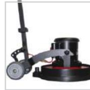
Optional Dust Control Ring Connects to Tank Vacuum