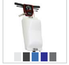
4.5 Gallon Solution Tank 5 Stock Colors 4 Special Order Colors #A0001-4-Color