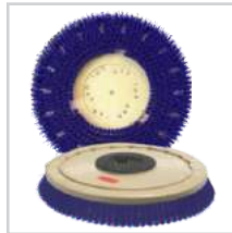
Lite Grit Brush Scrub with Flexible Blue 150 Grit Bristles #A0018-1 - 13" #A0038-1 - 15" #A0008-1 - 17" #A0009-1 - 20"