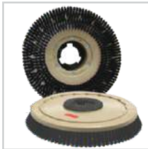
Stiff Poly Scrub Brush For General Scrubbing #A0020 - 13" #A0036 - 15" #A0002 - 17" #A0003 - 20"