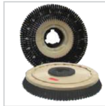
Grit Brush Strip/Scrub with Stiff Black 80 Grit Bristles #A0018 - 13" #A0038 - 15" #A0008 - 17" #A0009 - 20"