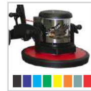
Brush Covers in 7 Stock Colors Plus Chrome