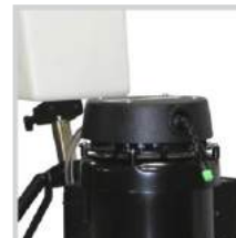
Motor with 45 PSI Solution Sprayer for XHD #Part Number