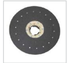
Diamond Pad Driver For HD & XHD #A0017DPD - 13" #A0034 - 15" #A0010DPD - 17" #A0011DPD - 20"