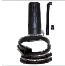
Vacuum Assembly Kit Dust Ring, Tank Vacuum & Hardware #TH1011-STD17 - 17" #TH1011-STD20 - 20"