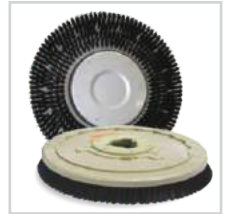
Hawk Spin Safe Carpet Brush w/Adjustable S/S Glide Plate Bears Machine Weight, Protects the Carpet #A0013-17 - 17" #A0013-20 - 20"