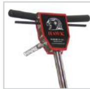
Welded Steel Frame, Handle & Brush Covers