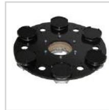
Orbitec Diamond Driver (6) Cups Hold 3" Diamond Tools, Steel Clutch Plate For XHD #HP0018 - 13" #HP0017-3 - 17"