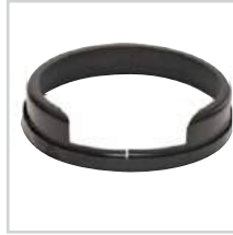
Splash Guard #SPLASH13 - 13" #SPLASH15 - 15" #SPLASH17 - 17" #SPLASH20 - 20"