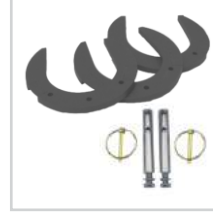
(1) 25# Horseshoe Wt. #HPA0032-1P Mounting Pin Kit #HP0023