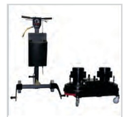
Disassembles for Transport & Storage