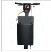
6 Gallon Solution Tank - Black #SME-2QR6BLK