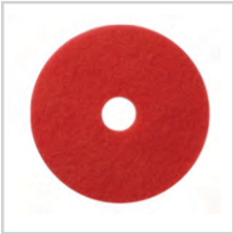
Red Buffing Pad (5 Pack) #A0026-15R-CS- 15"