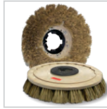
Tampico Polishing / Scrubbing Brush #A0035 - 15"