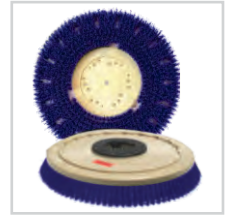
Lite Grit Brush Scrub with Flexible Blue 150 Grit Bristles #A0038-1 - 15"