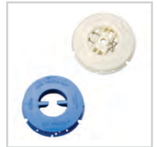
Pad Centering Clamp Pad Mount - 2 Piece Cesign #KIT2013 - Screw Lock #KIT2014 - Spring Lock

*Rotary brush blocks are 2" smaller than machine size. Rotary pad driver blocks are 1" smaller than machine size. All have Universal clutch plate.