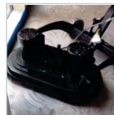
Offset Head Reaches Into Corners