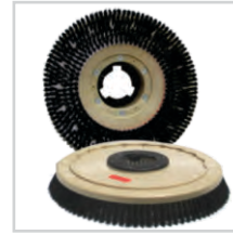
Stiff Poly Scrub Brush For General Scrubbing #A0036 - 15"