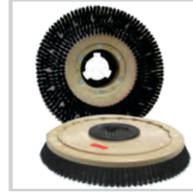
Stiff Poly Scrub Brush For General Scrubbing #A0036 - 15"