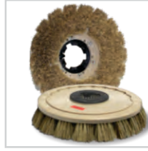
Tampico Polishing / Scrubbing Brush #A0035 - 15"