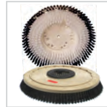
Nylon Carpet Brush Scrub with Soft & Stiff Nylon Bristle Xix #A0037 - 15"