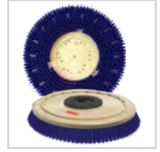
Lite Grit Brush Scrub with Flexible Blue 150 Grit Bristles #A0038-1 - 15"