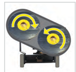
Includes 2 Counter- Rotating Pad Drivers