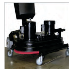
Includes Transport Cart