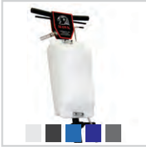
4 Gallon Solution Tank 5 Stock Colors 3 Special Order Colors #A0001-4GLIDE-Color