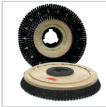
Grit Brush Strip/Scrub with Stiff Black 80 Grit Bristles #A0038 - 15"