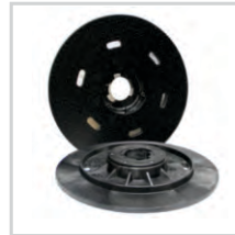
Premium Double Hook Pad Driver w/ Riser #A0034 - 15"

*Rotary brush blocks are 2" smaller than machine size. Rotary pad driver blocks are 1" smaller than machine size. All have Universal clutch plate.