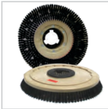
Grit Brush Strip/Scrub with Stiff Black 80 Grit Bristles #A0038 - 15"