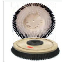
Nylon Carpet Brush Scrub with Soft & Stiff Nylon Bristle Xix #A0037 - 15"